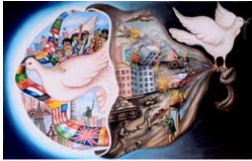
"Vision of Peace" 2010-11 Grand Prize Winner

Each year, Lions clubs around the world proudly sponsor the Lions International Peace Poster Contest in local schools and youth groups. This Contest encourages young people worldwide to artistically express their visions of peace. During the last 20 years, more than four million children from nearly 100 countries have participated in the contest.